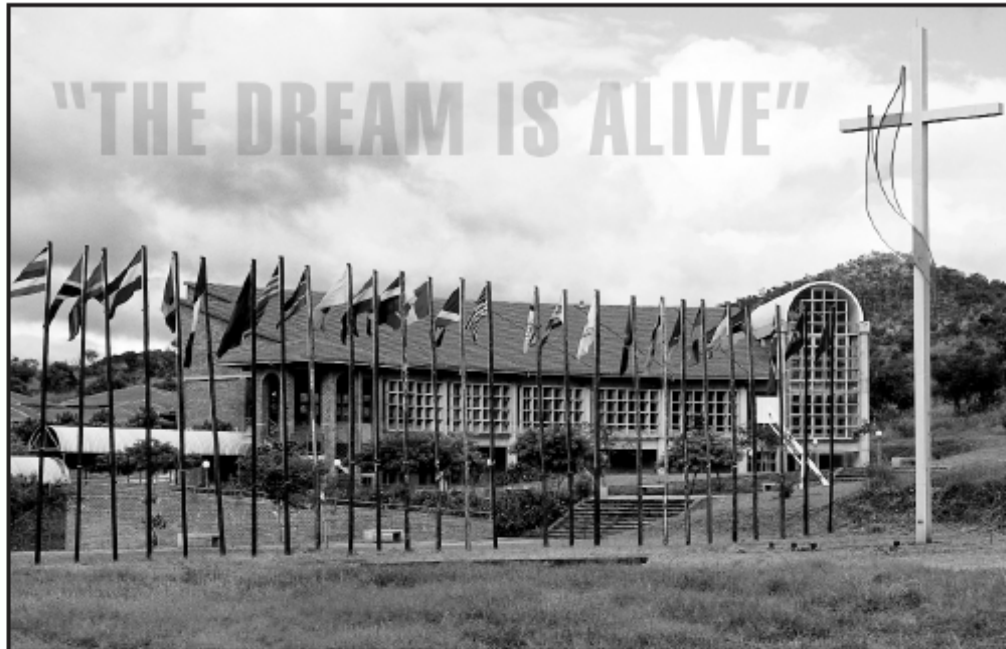
BRIEF DESCRIPTION - ROW OF FLAGS REPRESENTING...AT AFRICA UNIVERSITY